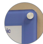
1" Corner Radius

*Please ensure you have clearance on either side of the board to remove the insert as needed